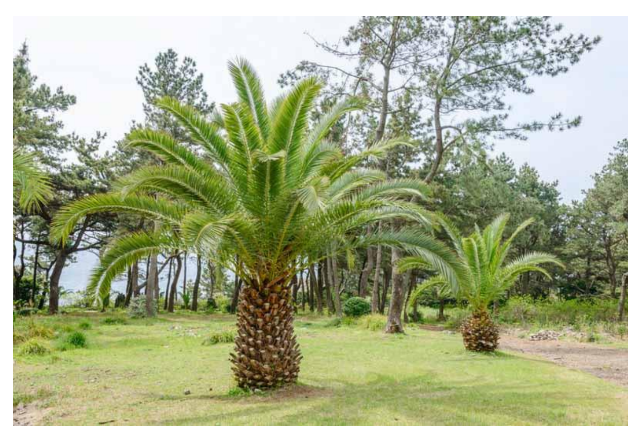
Canary Island Date Palm