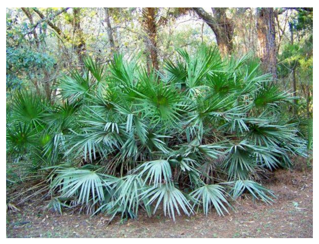
Saw Palmetto, dwarf